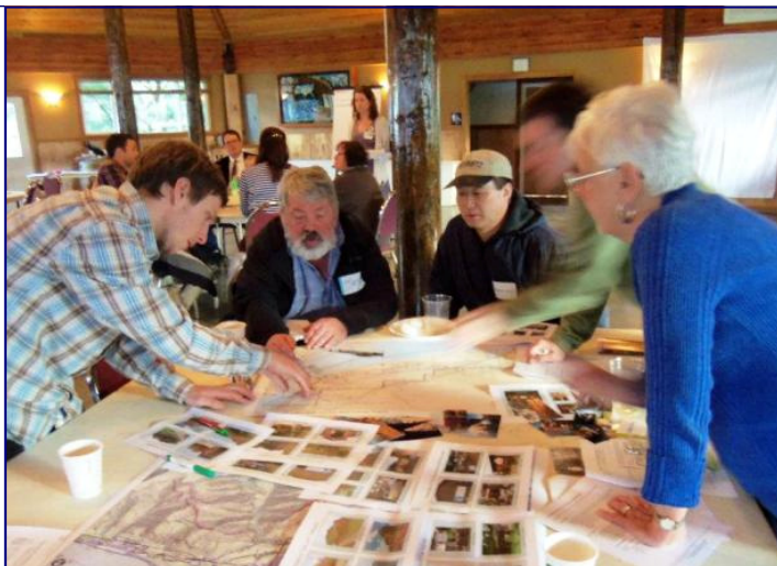
Above: Cascade Locks residents and business owners provide ideas on ways to connect regional trails to businesses in Cascade Locks.